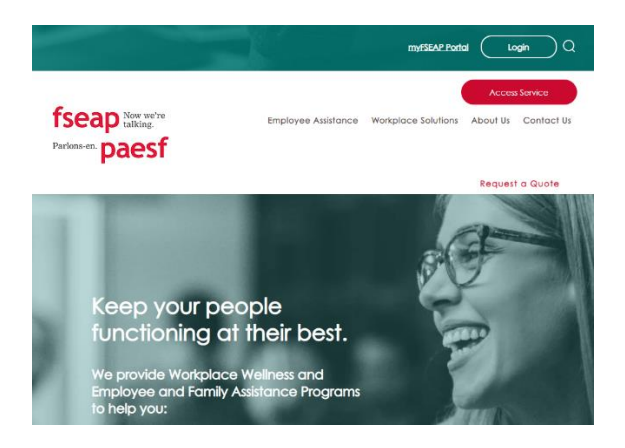
Step 2 – Click on the Login icon.

Step 1 – Click on the link above and it will direct you to the Home page.